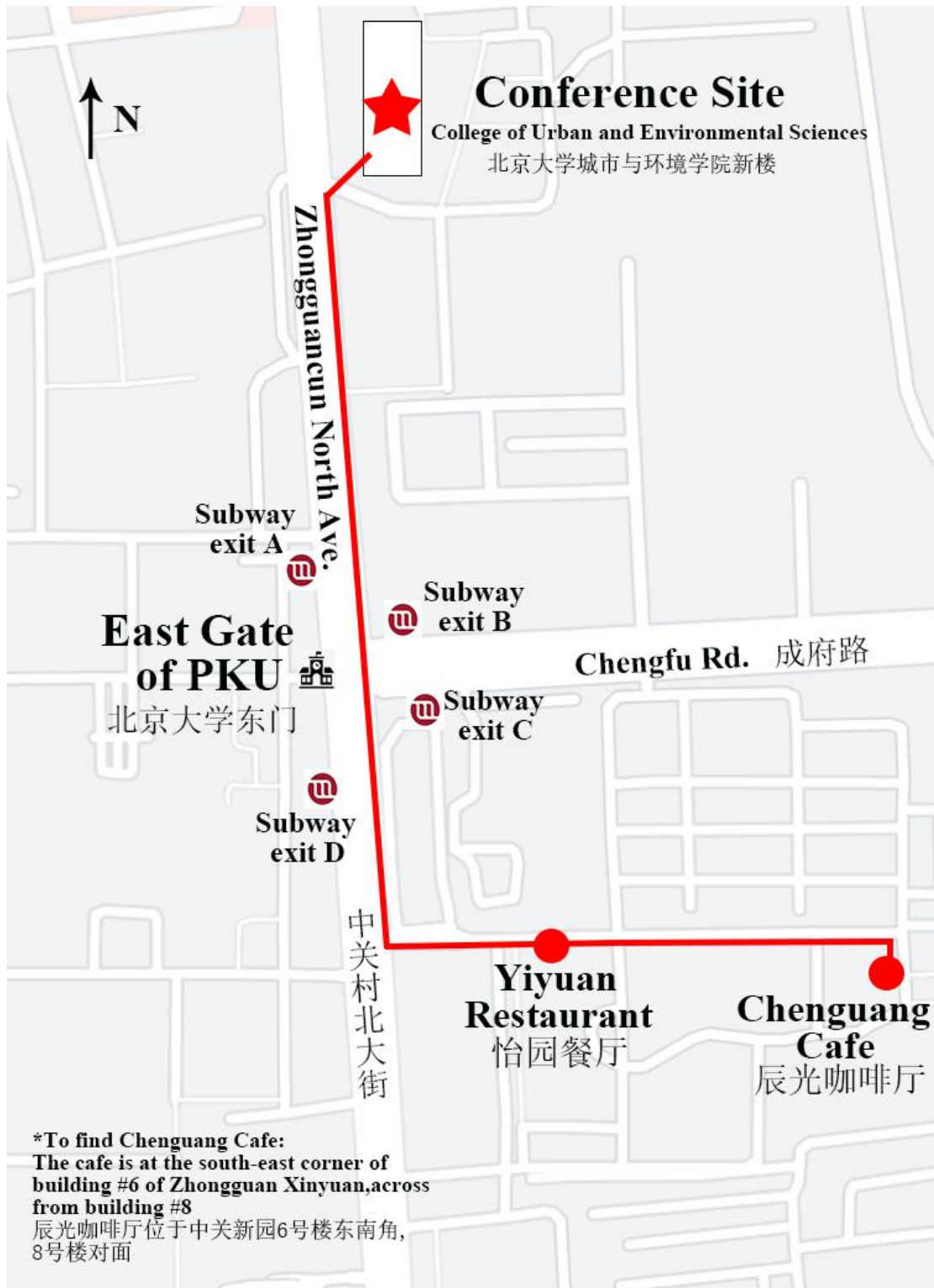
Map of Conference Site