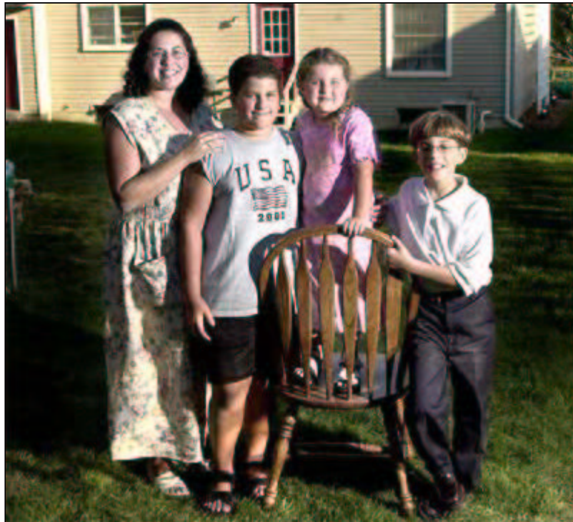
"We're Catholic, the people across the street are Jewish, there are people of Oriental descent and our kids play with the African American kids down the street."

Use of this site indicates your agreement to the Terms of Service (updated 08/09/2001).